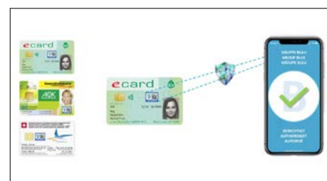
Figure 3: smartphone authentication of the AV health tag.

The app can either be integrated into an existing mobile application or published as a stand-alone app in the customer's design. The message that is displayed after successful authentication can be customised to include information from health authorities and concrete recommendations for action.