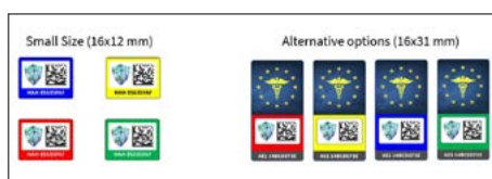
Figure 2: AV health tag design and sizes.